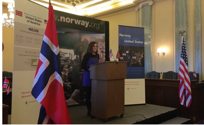
Congresswoman Martha McSally (R), AZ