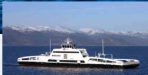
The first all-electric Norwegian car ferry, Ampere

The U.S. Capitol Visitor Center, the main entrance to the U.S. Capitol, is located beneath the East Front plaza of the U.S. Capitol at First St. and East Capitol St.